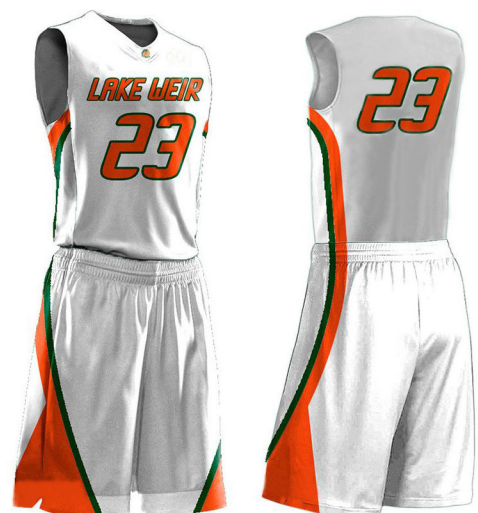
ART # JI-1084