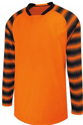
ART # JI-1225