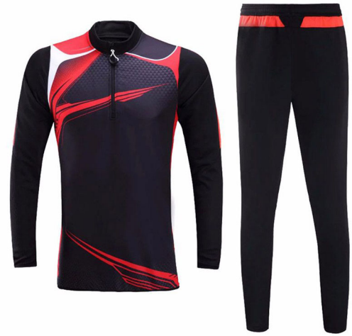
ART # JI-1142