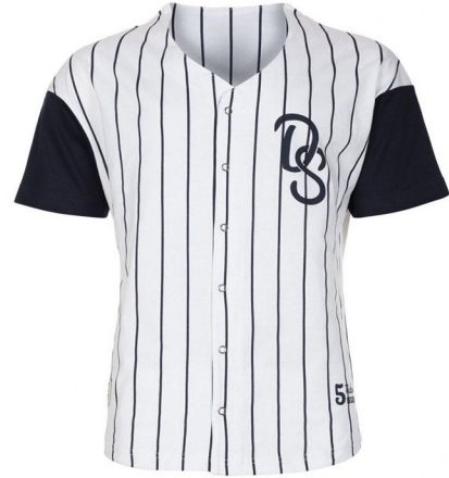
ART # JI-1026