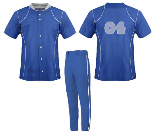
ART # JI-1008