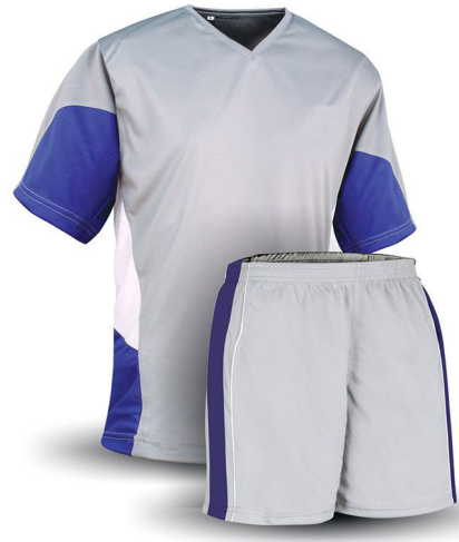
ART # JI-1106