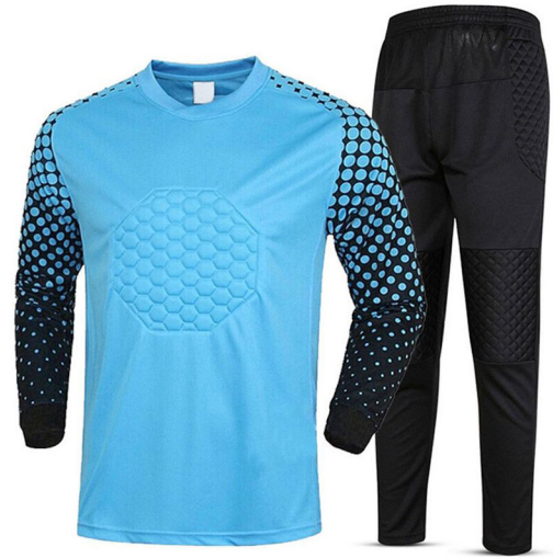
ART # JI-1206