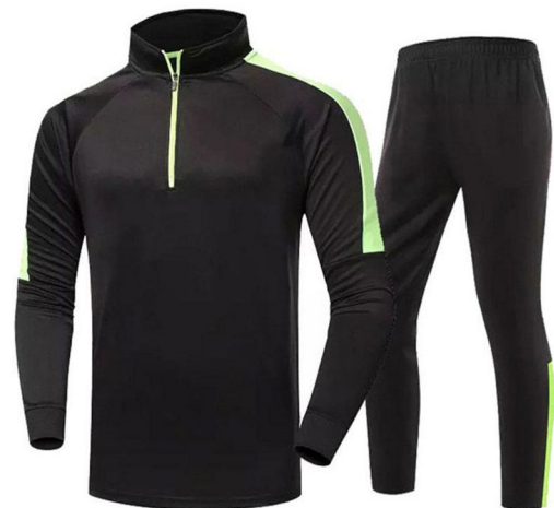
ART # JI-1144