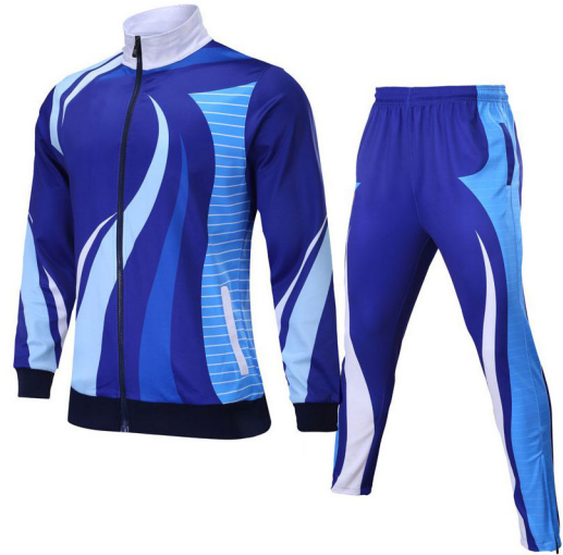
ART # JI-1146