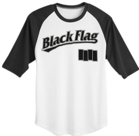
ART # JI-1023