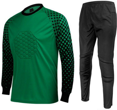
ART # JI-1205