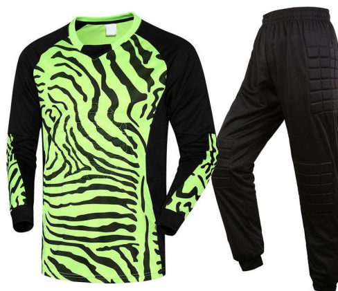
ART # JI-1204