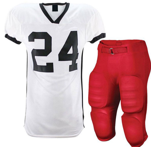
ART # JI-1068