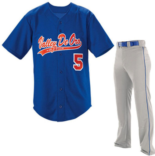
ART # JI-1001