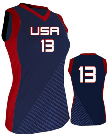
ART # JI-1183