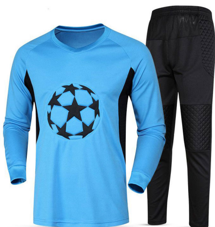
ART # JI-1203