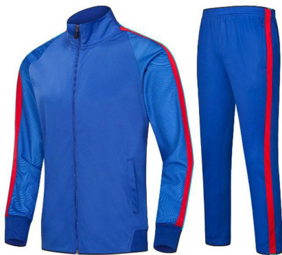
ART # JI-1143