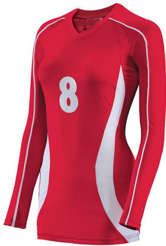
ART # JI-1181