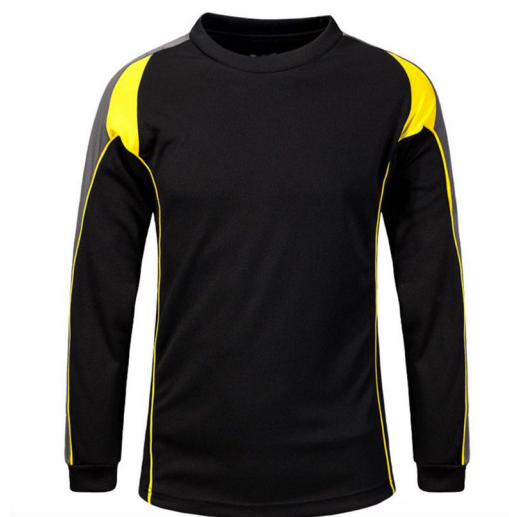
ART # JI-1124