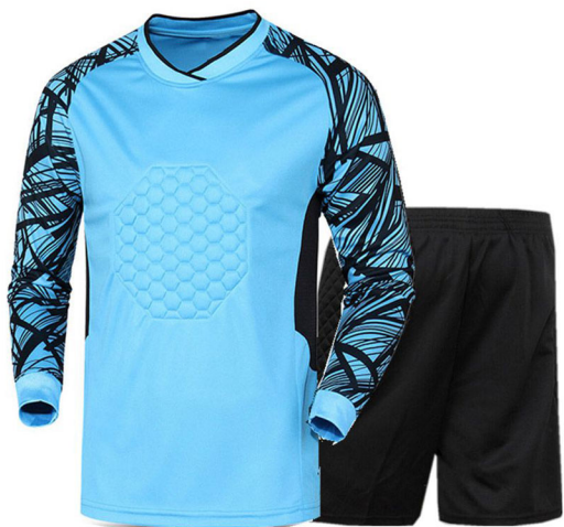
ART # JI-1201