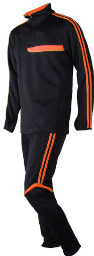
ART # JI-1147