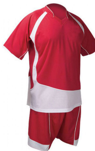
ART # JI-1104