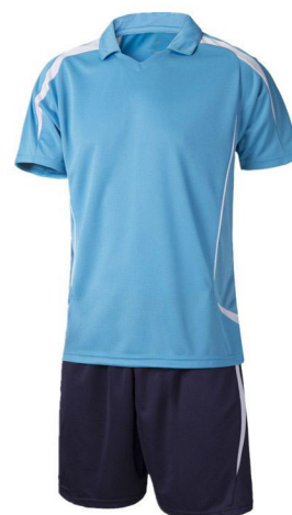
ART # JI-1168