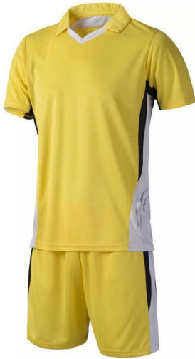
ART # JI-1165