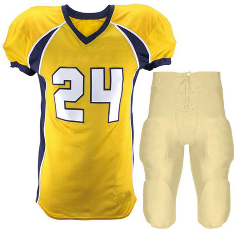
ART # JI-1067