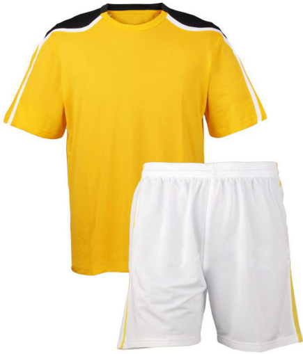
ART # JI-1105