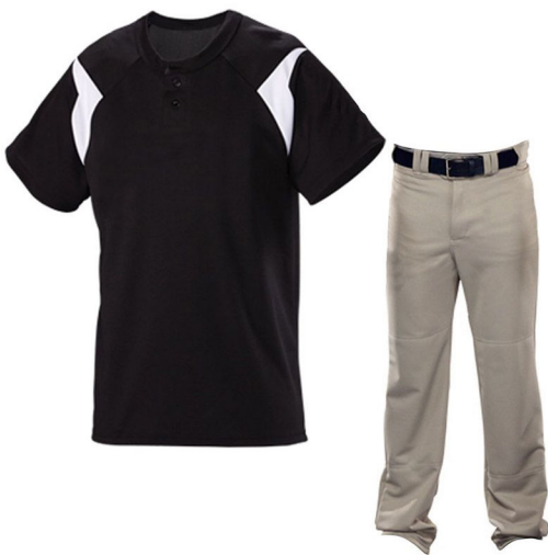
ART # JI-1003