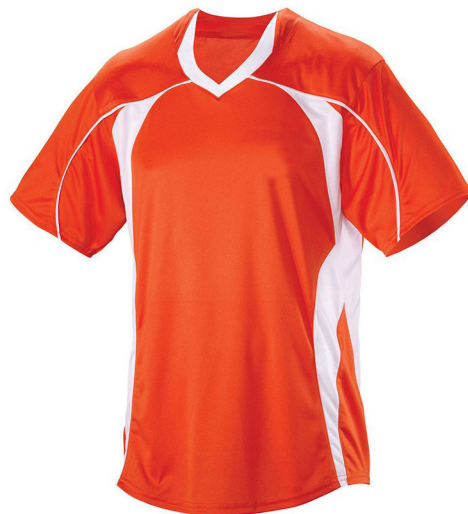
ART # JI-1126