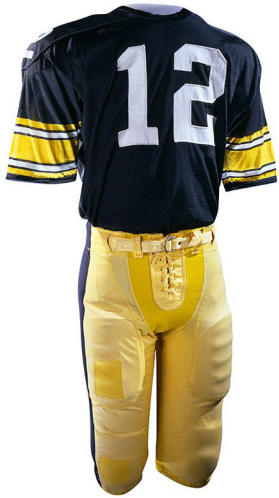
ART # JI-1065