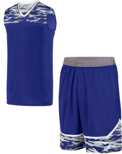
ART # JI-1086