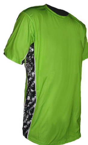
ART # JI-1224