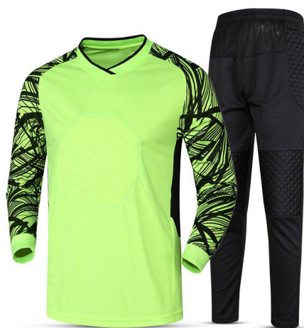
ART # JI-1202