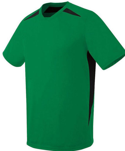
ART # JI-1182