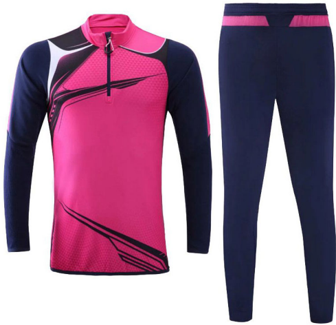
ART # JI-1145