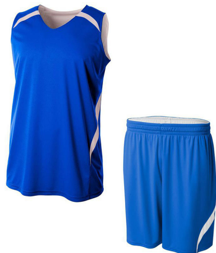
ART # JI-1088