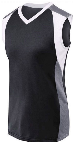
ART # JI-1167