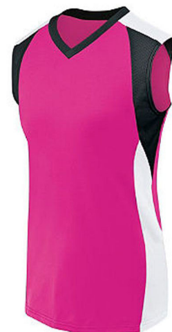
ART # JI-1184