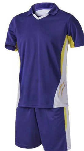
ART # JI-1164