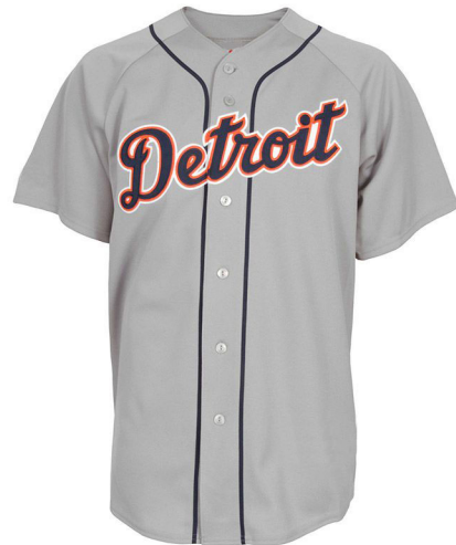
ART # JI-1028