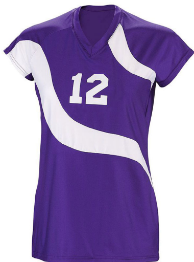
ART # JI-1181