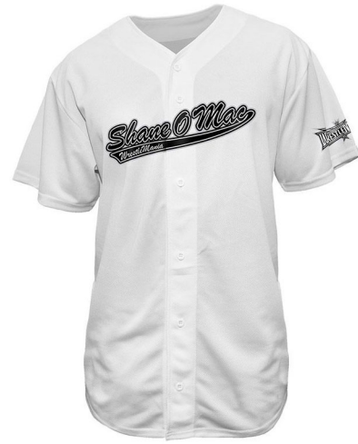
ART # JI-1022