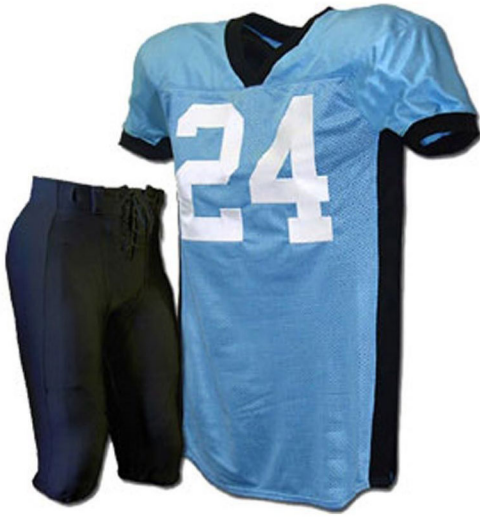
ART # JI-1061