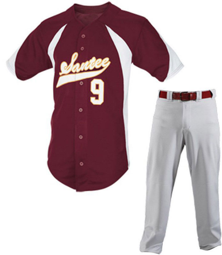
ART # JI-1002