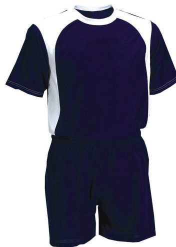
ART # JI-1102