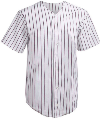
ART # JI-1025