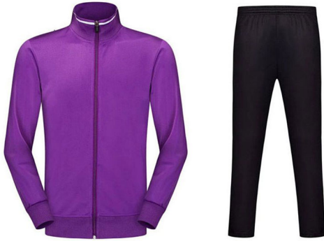
ART # JI-1141