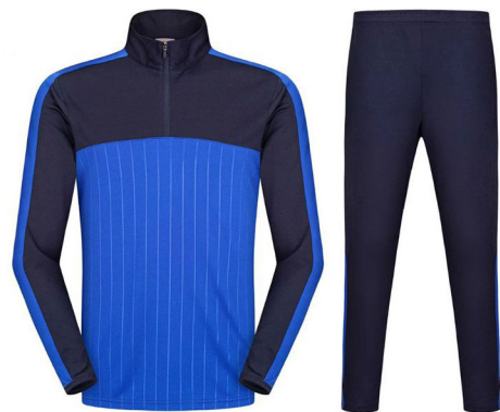
ART # JI-1148