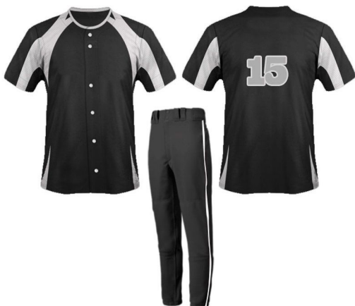
ART # JI-1007