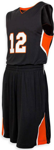
ART # JI-1085