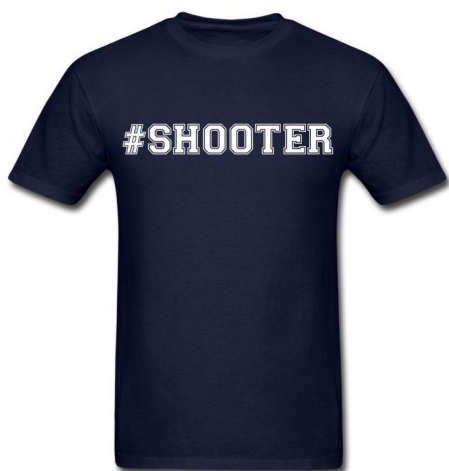
ART # JI-1221