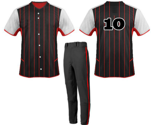
ART # JI-1006