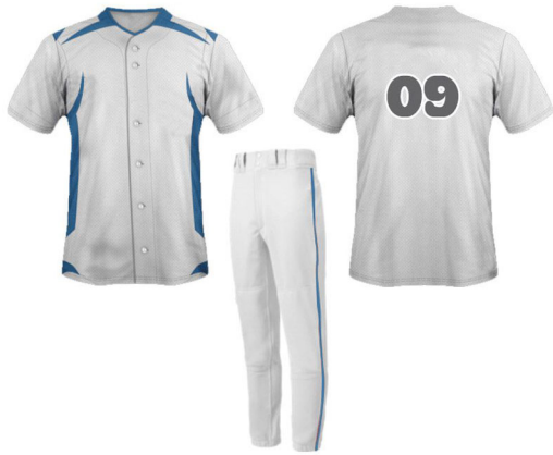
ART # JI-1005