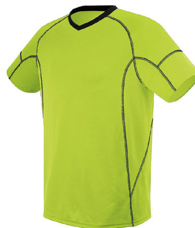
ART # JI-1122