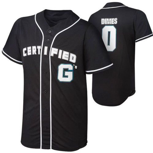
ART # JI-1021