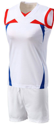
ART # JI-1162