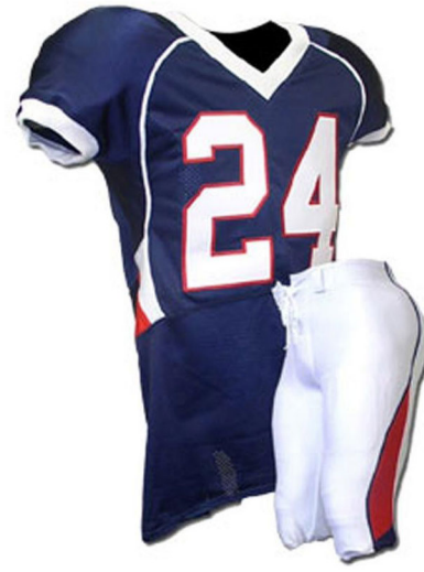
ART # JI-1062