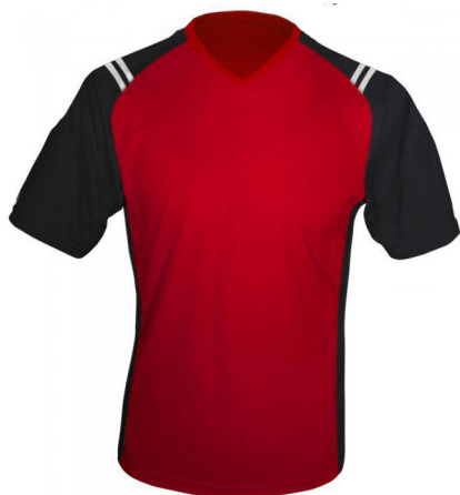
ART # JI-1121