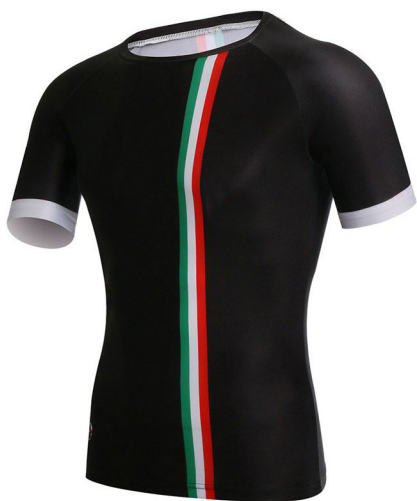
ART # JI-1125