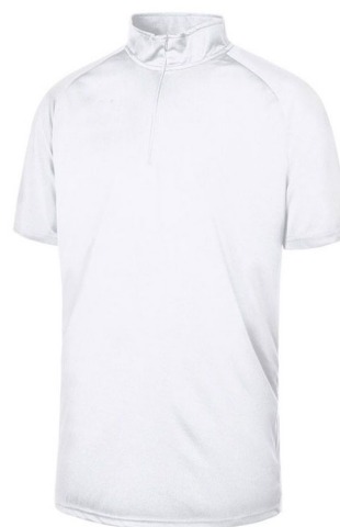
ART # JI-1226