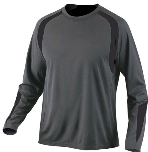
ART # JI-1227