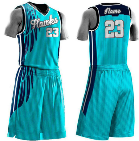
ART # JI-1082