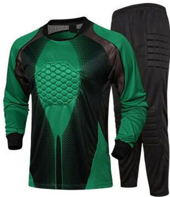
ART # JI-1207