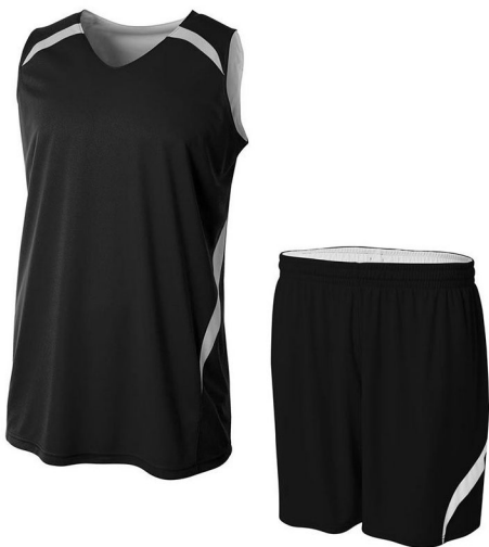
ART # JI-1087