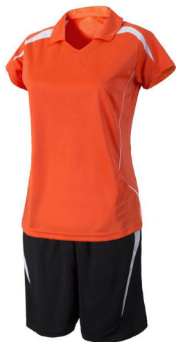
ART # JI-1163