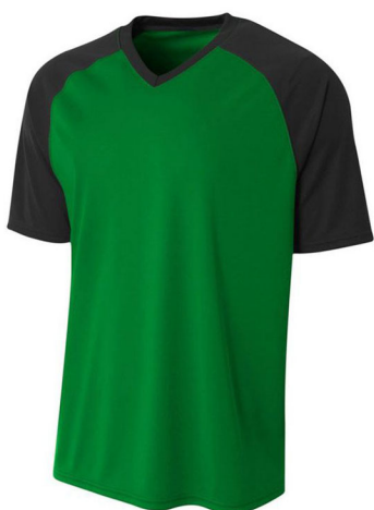
ART # JI-1123