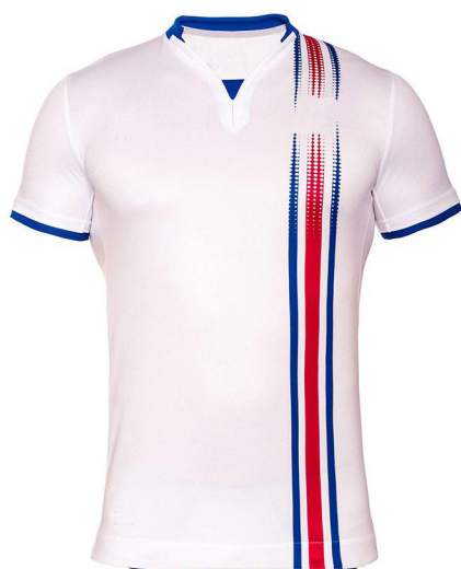
ART # JI-1127