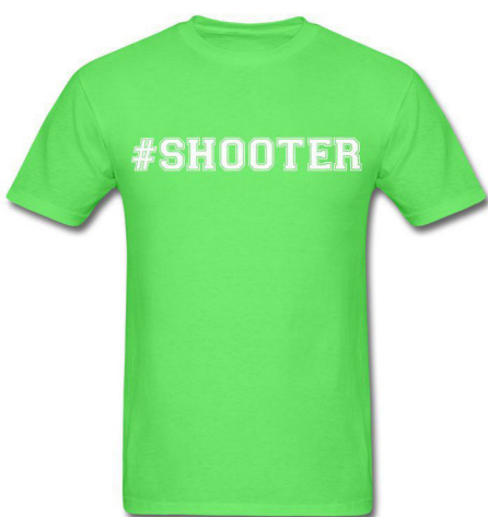
ART # JI-1223