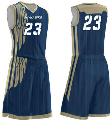
ART # JI-1081