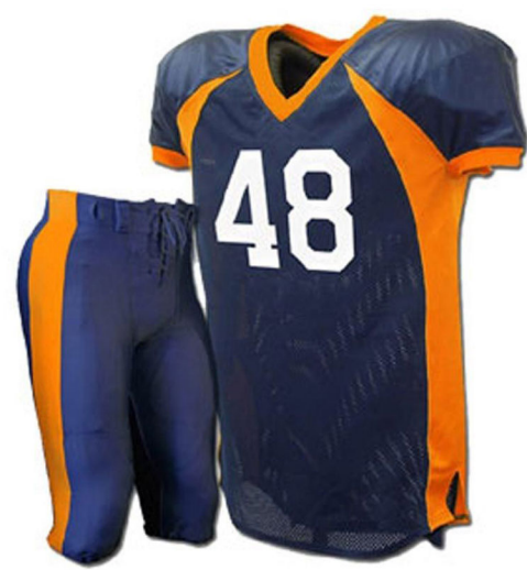
ART # JI-1064