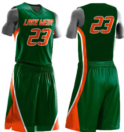
ART # JI-1083