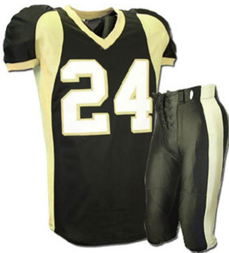
ART # JI-1063