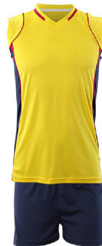
ART # JI-1166