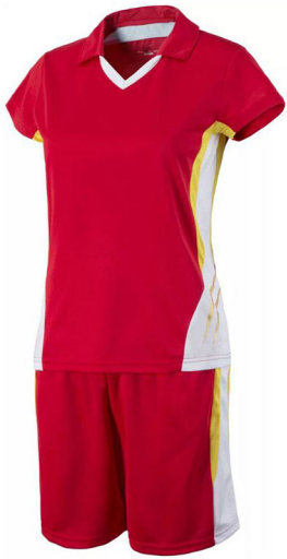
ART # JI-1161