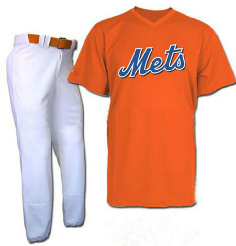
ART # JI-1004