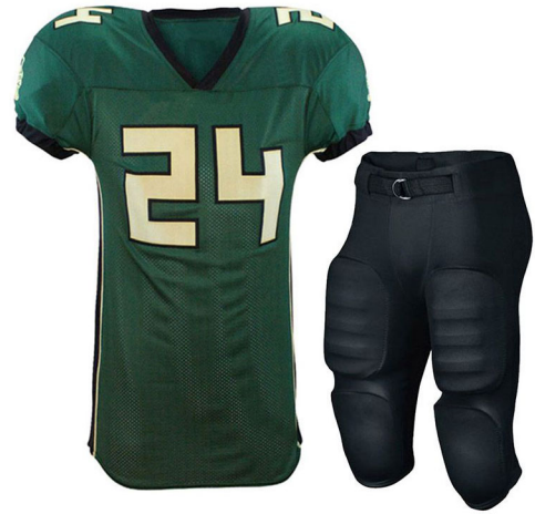
ART # JI-1066