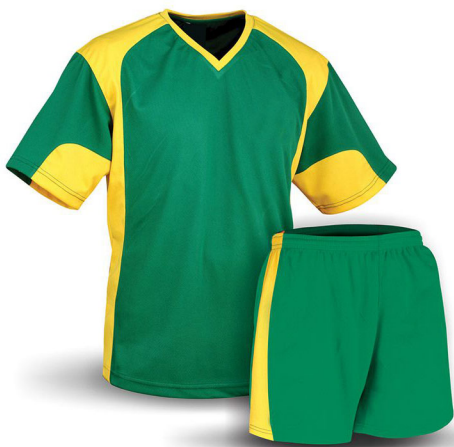
ART # JI-1107