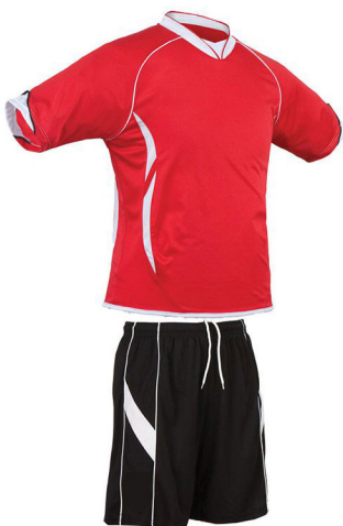
ART # JI-1101