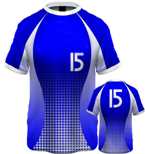
ART # JI-1182