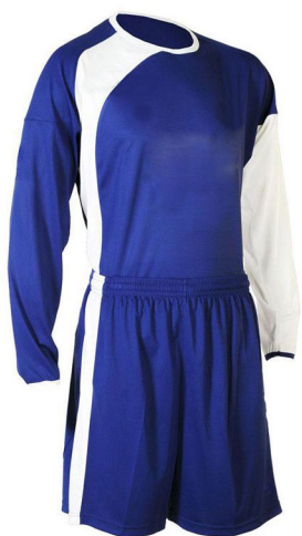
ART # JI-1103