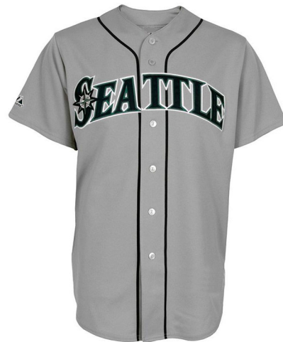
ART # JI-1024