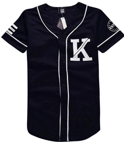
ART # JI-1027