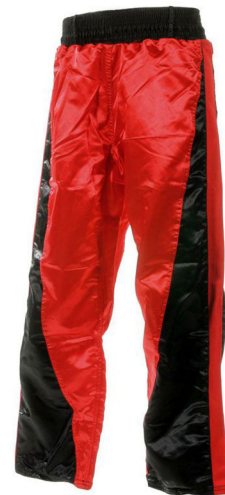
ART # JI-2604