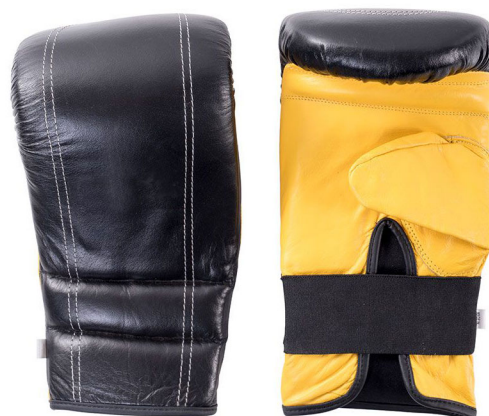
ART # JI-2704