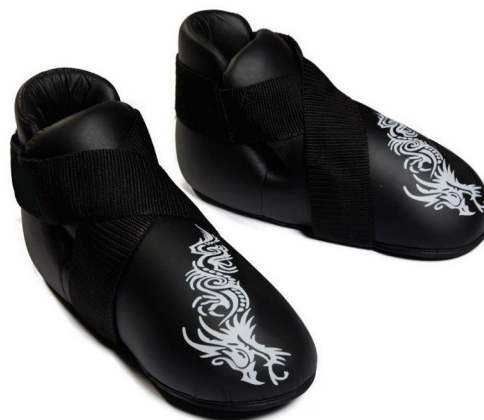
ART # JI-2582