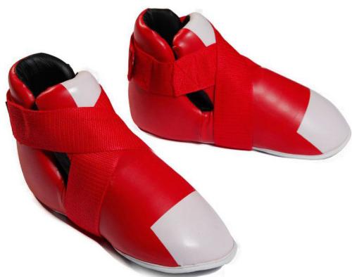
ART # JI-2583