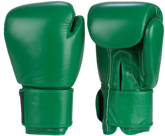
ART # JI-2526