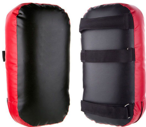
ART # JI-2745