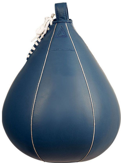
ART # JI-2547