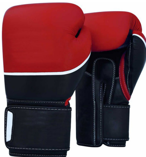
ART # JI-2522