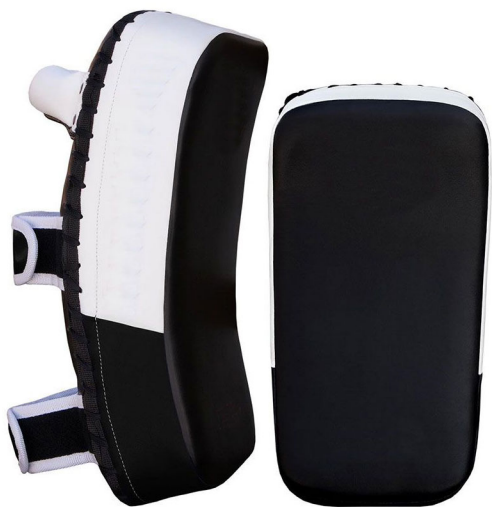
ART # JI-2741