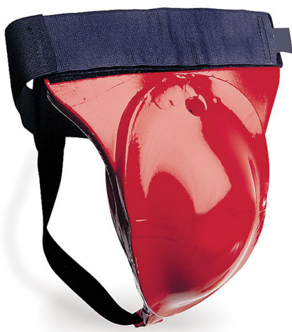
ART # JI-2843