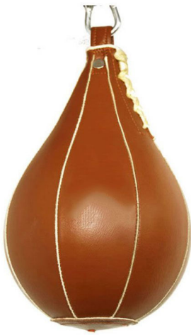
ART # JI-2541