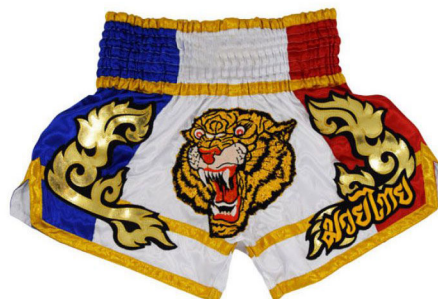
ART # JI-2626