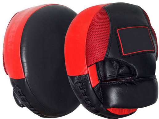
ART # JI-2865