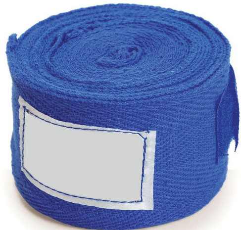
ART # JI-2824