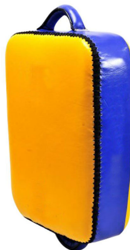
ART # JI-2646