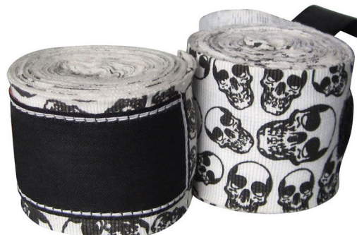
ART # JI-2826