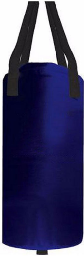
ART # JI-2781