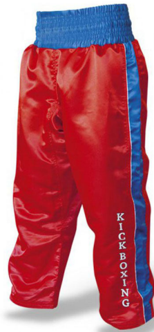
ART # JI-2606