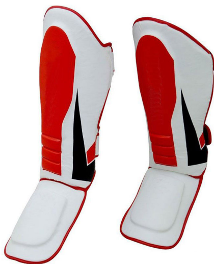
ART # JI-2563