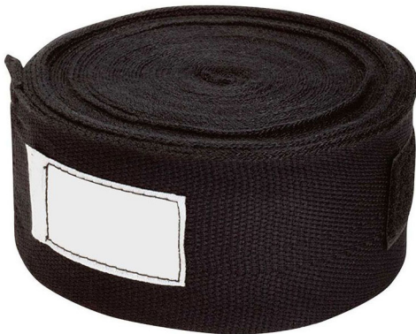
ART # JI-2823