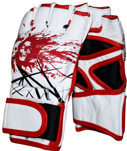
ART # JI-2501