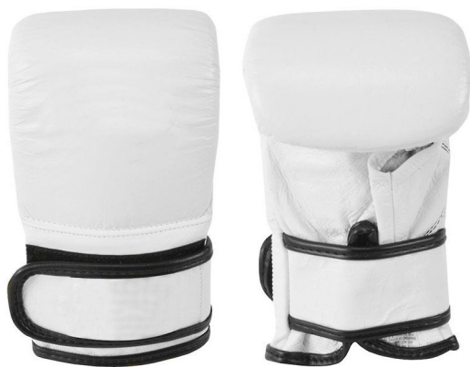
ART # JI-2707