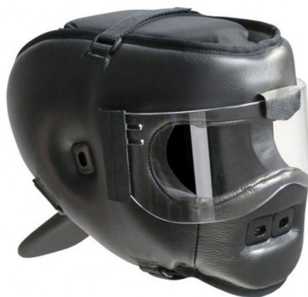
ART # JI-2802