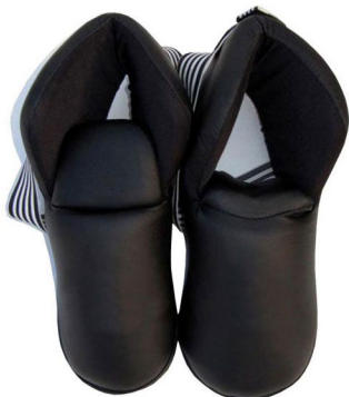
ART # JI-2581