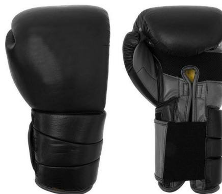
ART # JI-2524