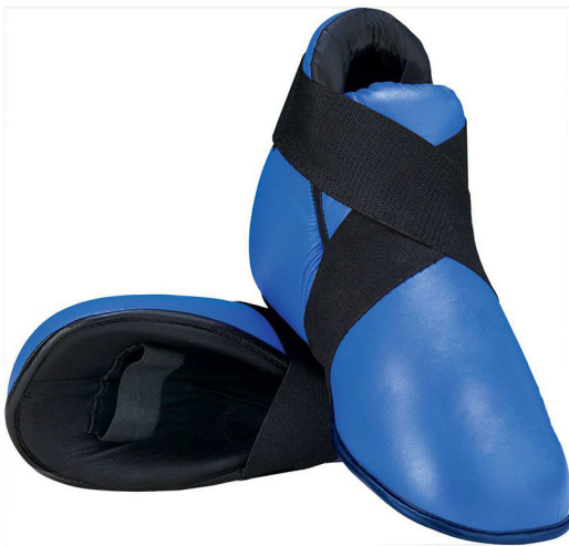
ART # JI-2587