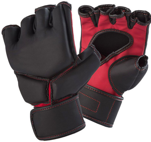
ART # JI-2505