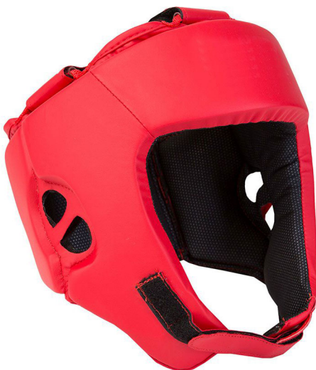
ART # JI-2807