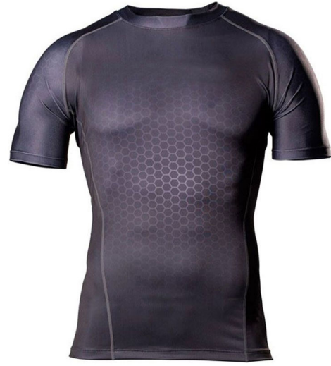
ART # JI-2722