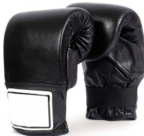
ART # JI-2702