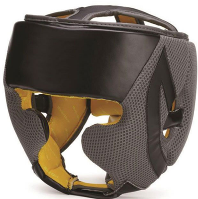
ART # JI-2801