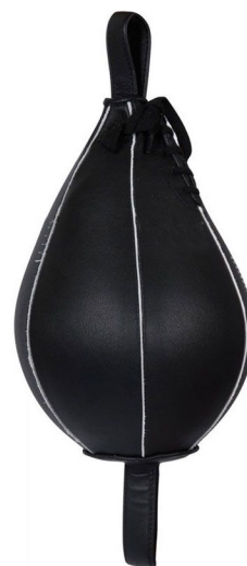
ART # JI-2888