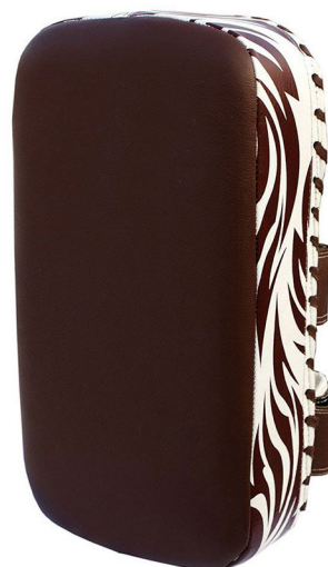
ART # JI-2744