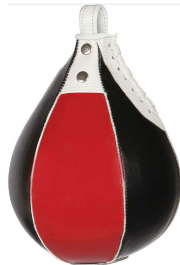
ART # JI-2544