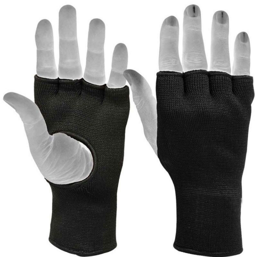
ART # JI-2761