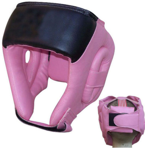
ART # JI-2805