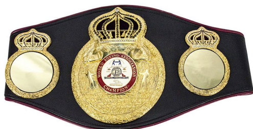
ART # JI-2687