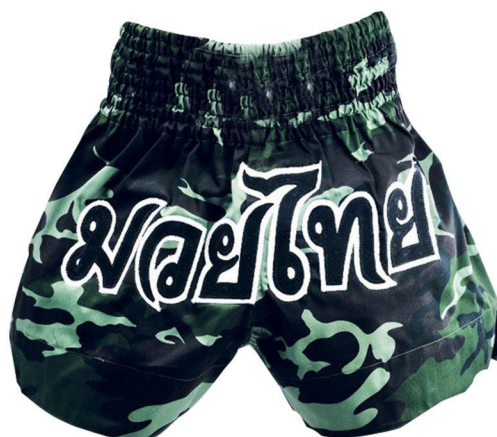
ART # JI-2624