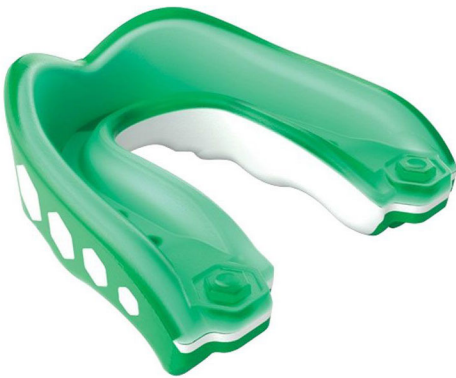
ART # JI-2663