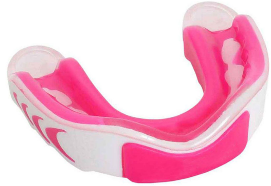
ART # JI-2662