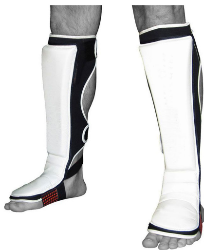
ART # JI-2564