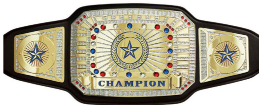
ART # JI-2685