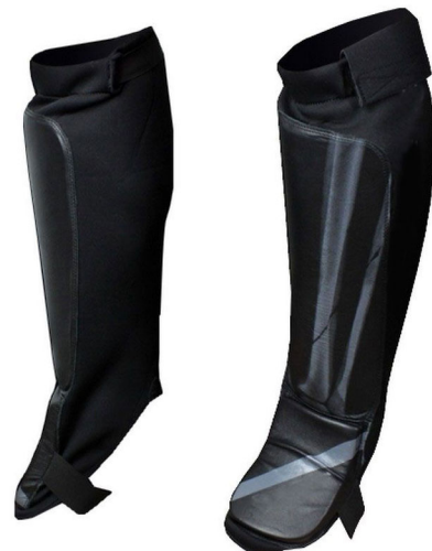
ART # JI-2566