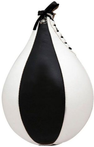
ART # JI-2545