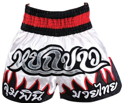
ART # JI-2623