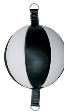
ART # JI-2884