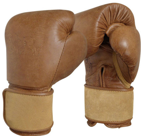
ART # JI-2521