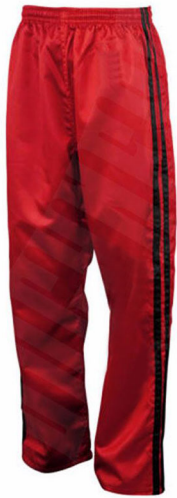
ART # JI-2601