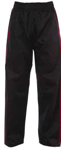
ART # JI-2602