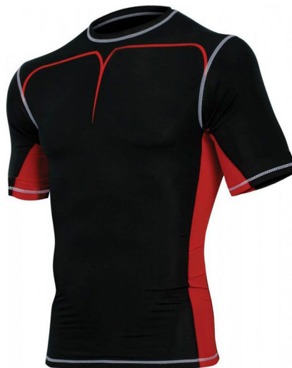
ART # JI-2726