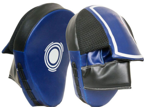
ART # JI-2863