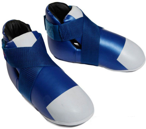
ART # JI-2585