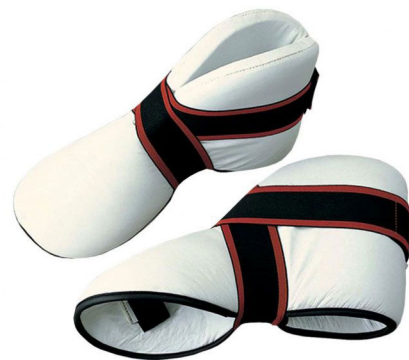
ART # JI-2588