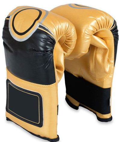
ART # JI-2703