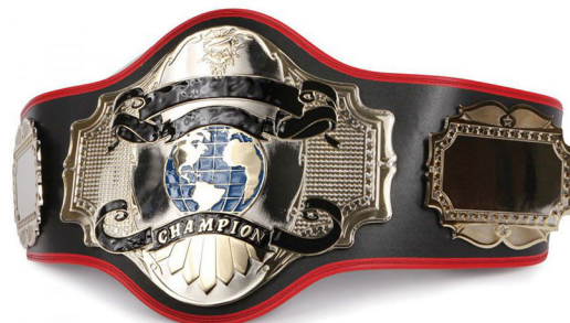
ART # JI-2682