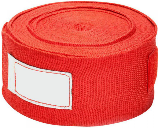
ART # JI-2821