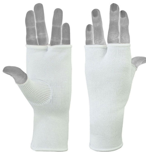
ART # JI-2762