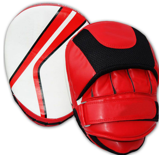
ART # JI-2866