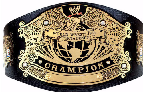
ART # JI-2686