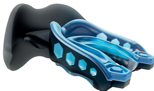
ART # JI-2666