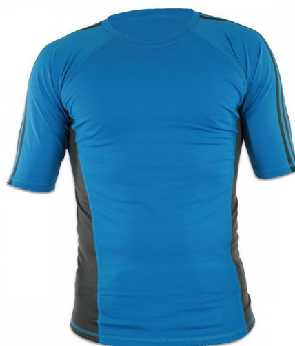
ART # JI-2728