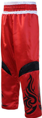
ART # JI-2603