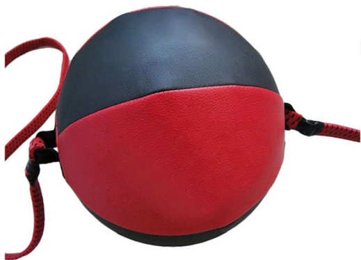
ART # JI-2885