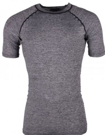
ART # JI-2727