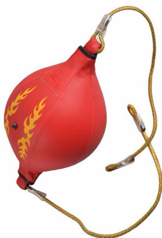
ART # JI-2887