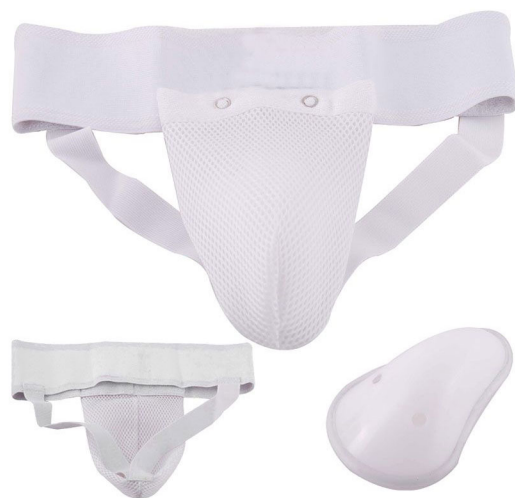
ART # JI-2842