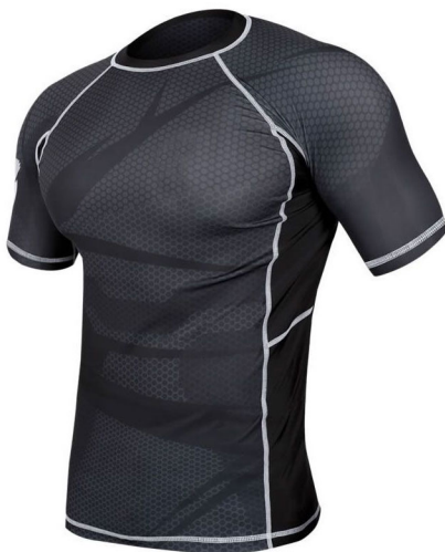
ART # JI-2723