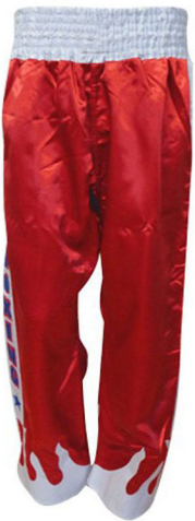
ART # JI-2607