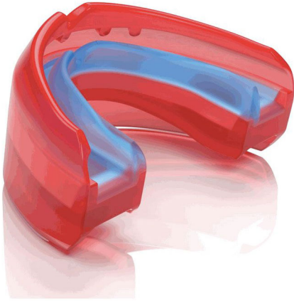
ART # JI-2661