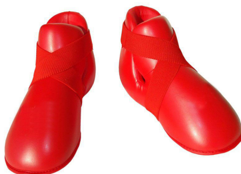
ART # JI-2584