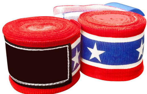
ART # JI-2825