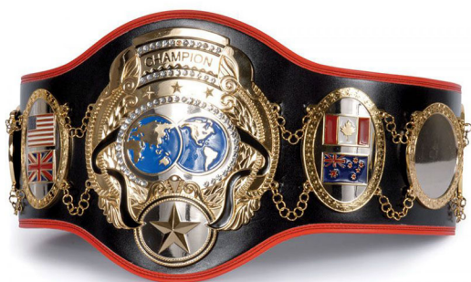
ART # JI-2683