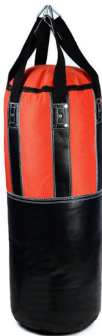
ART # JI-2783