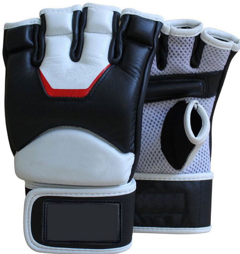
ART # JI-2507