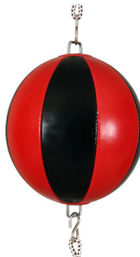
ART # JI-2882