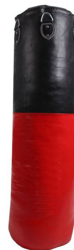
ART # JI-2784