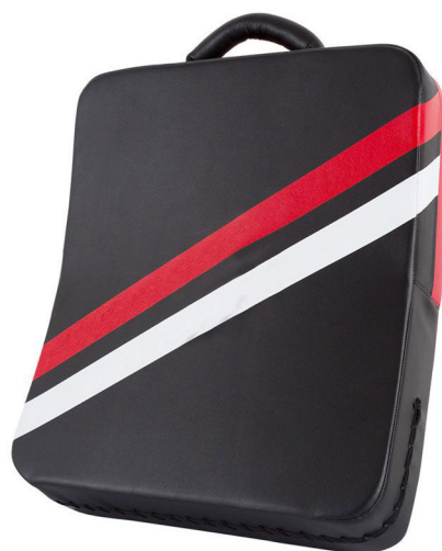
ART # JI-2644