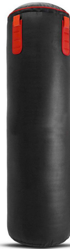
ART # JI-2786