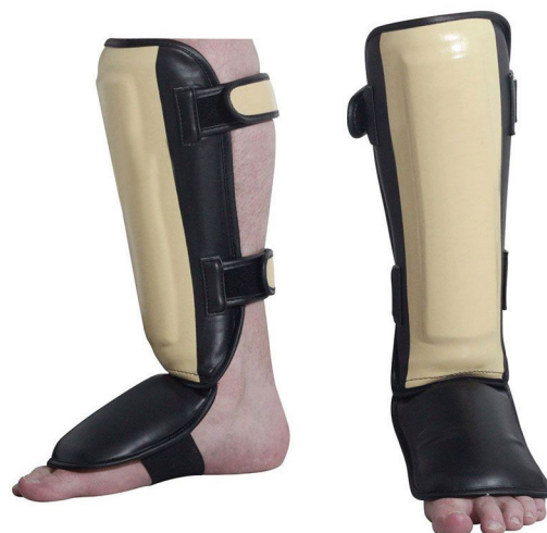
ART # JI-2568