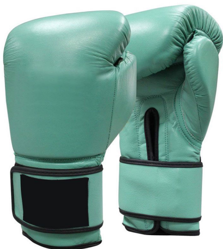
ART # JI-2527