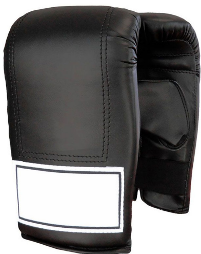
ART # JI-2701