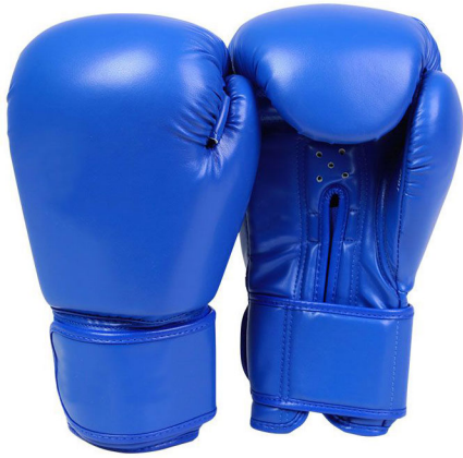
ART # JI-2525