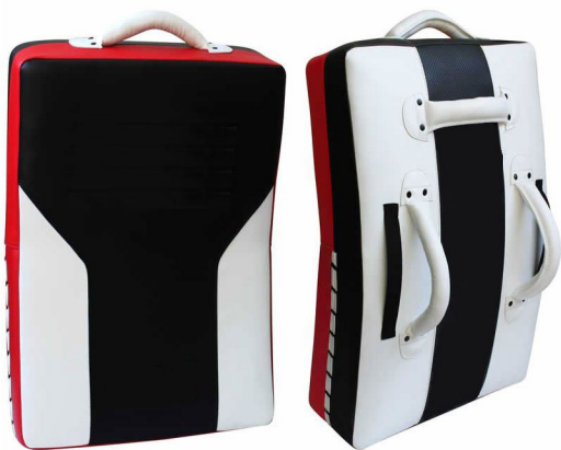
ART # JI-2641