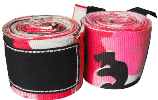
ART # JI-2827