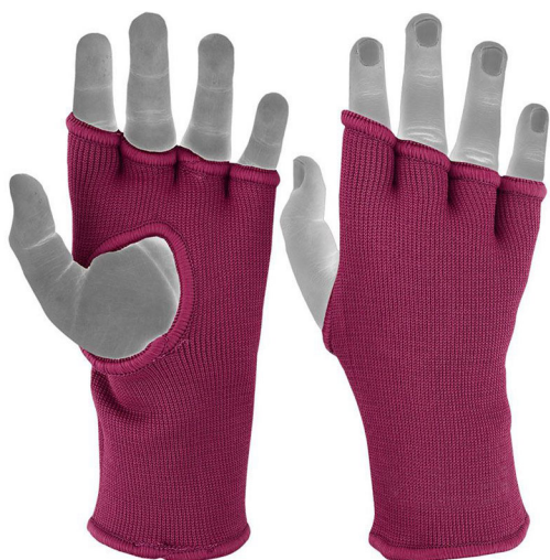
ART # JI-2763