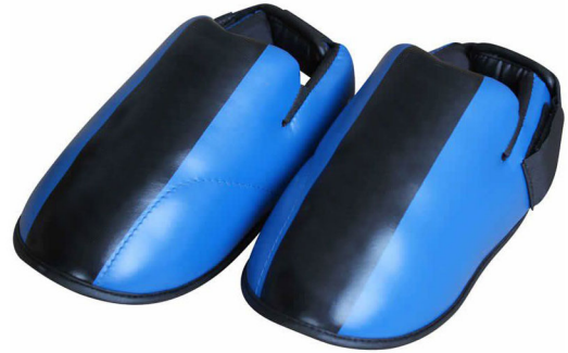
ART # JI-2586