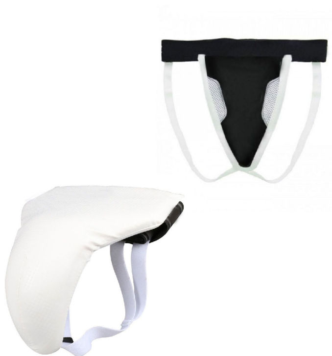
ART # JI-2844