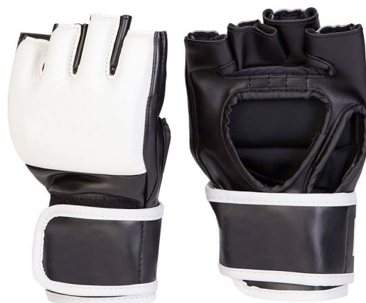
ART # JI-2504