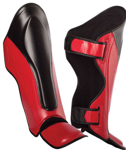
ART # JI-2562