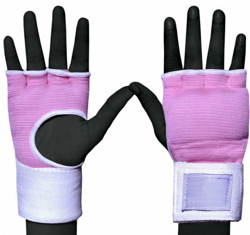
ART # JI-2765