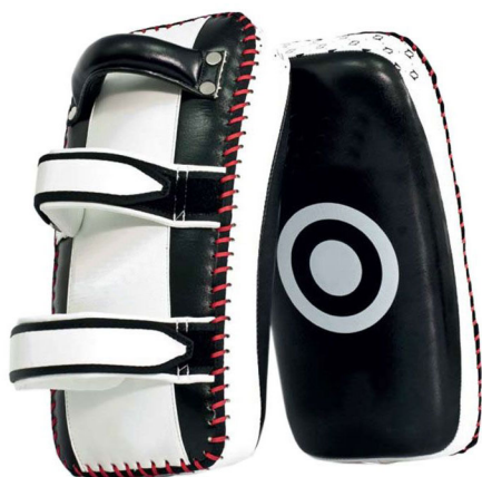
ART # JI-2743