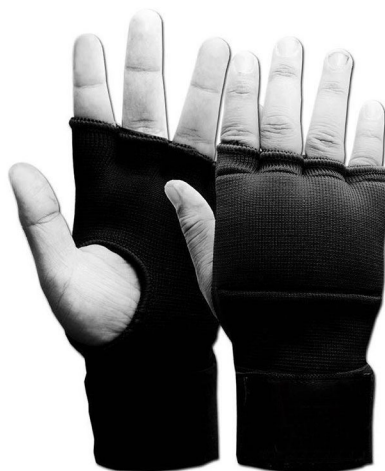
ART # JI-2766