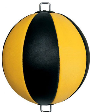
ART # JI-2881