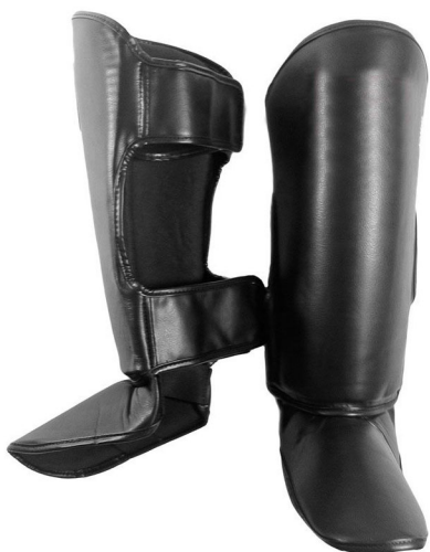
ART # JI-2565