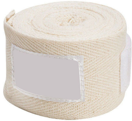
ART # JI-2822