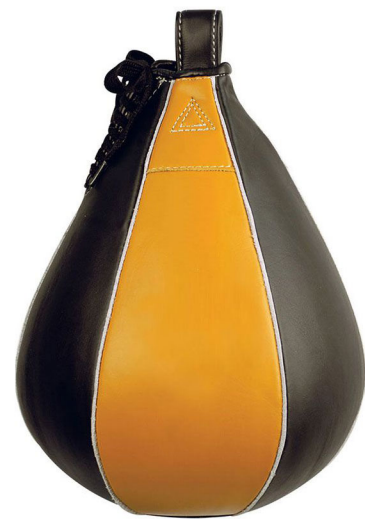
ART # JI-2548