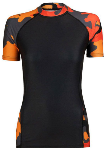
ART # JI-2725