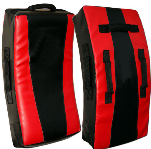
ART # JI-2643