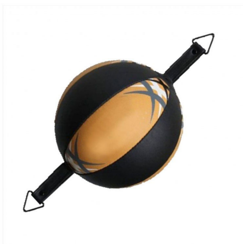
ART # JI-2883