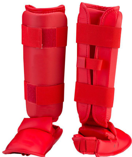
ART # JI-2561