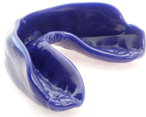
ART # JI-2664