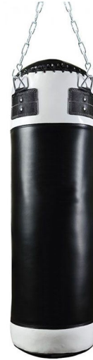
ART # JI-2782