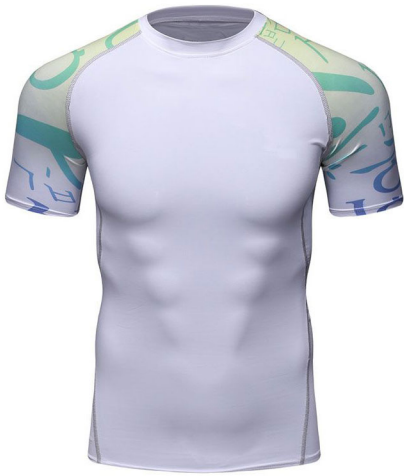
ART # JI-2721