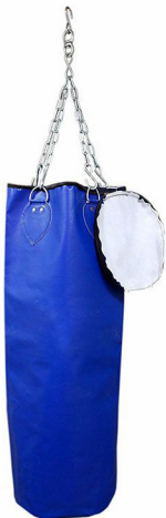
ART # JI-2787