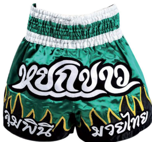
ART # JI-2622