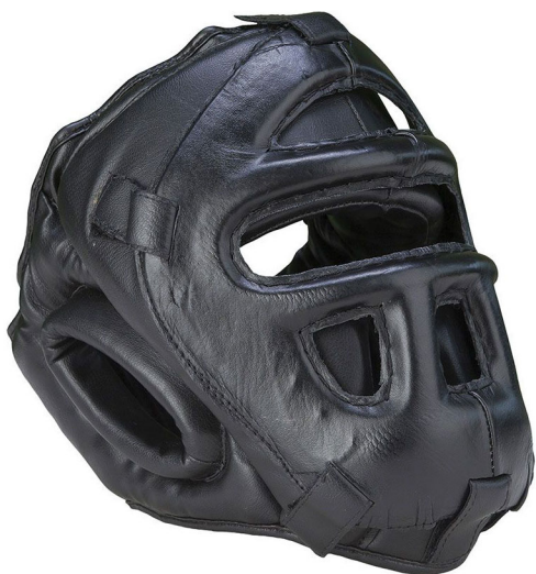
ART # JI-2803