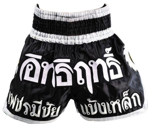
ART # JI-2621