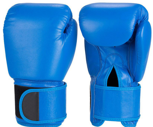
ART # JI-2528