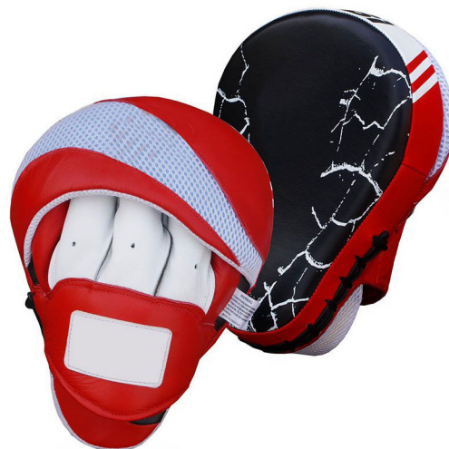
ART # JI-2862