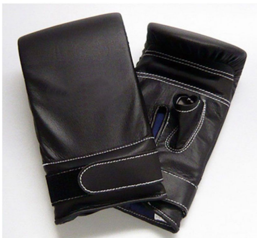
ART # JI-2705