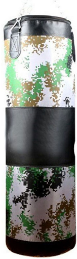
ART # JI-2785