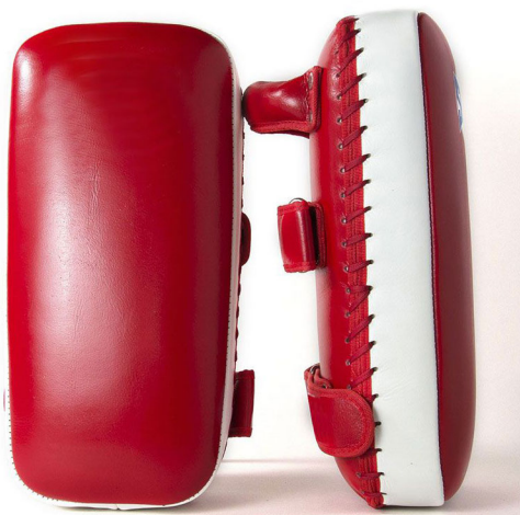
ART # JI-2747