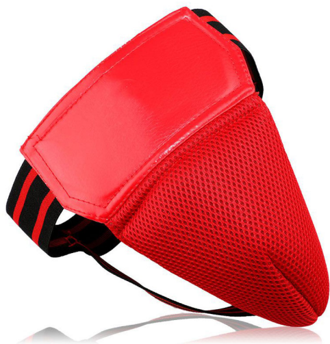
ART # JI-2841