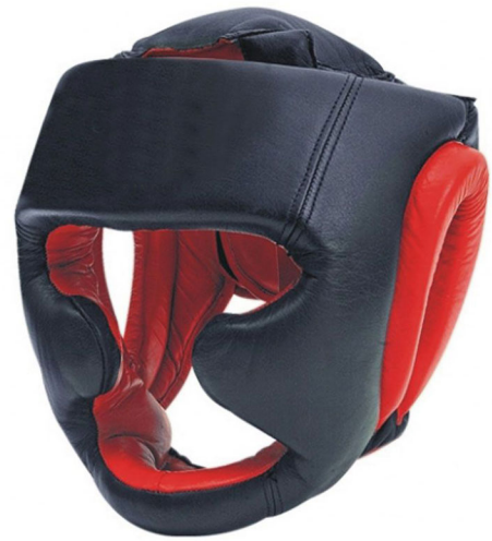
ART # JI-2806