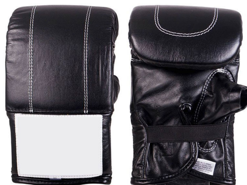
ART # JI-2708