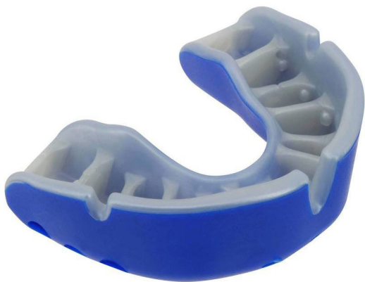
ART # JI-2665