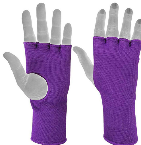
ART # JI-2764