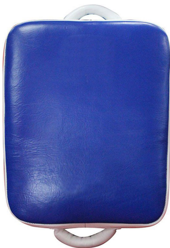
ART # JI-2645