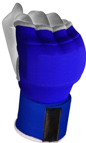
ART # JI-2767