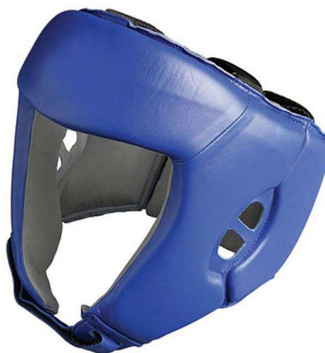
ART # JI-2804