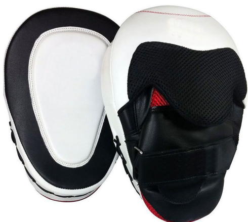
ART # JI-2861