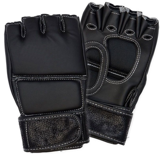
ART # JI-2506