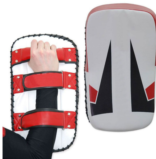
ART # JI-2742