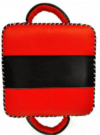
ART # JI-2647