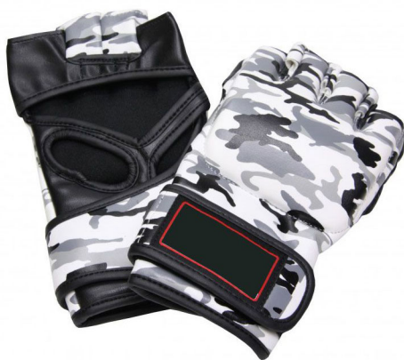
ART # JI-2503