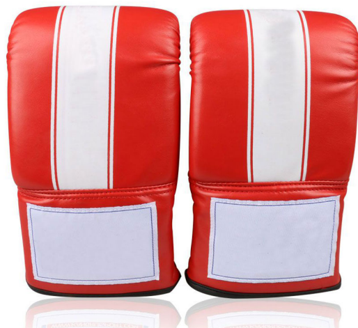
ART # JI-2706