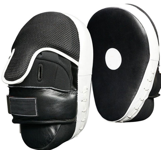
ART # JI-2867