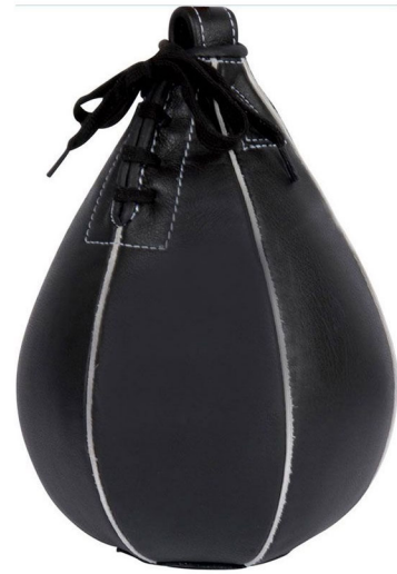
ART # JI-2546