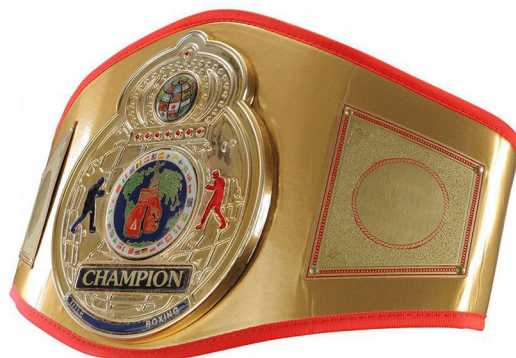
ART # JI-2684