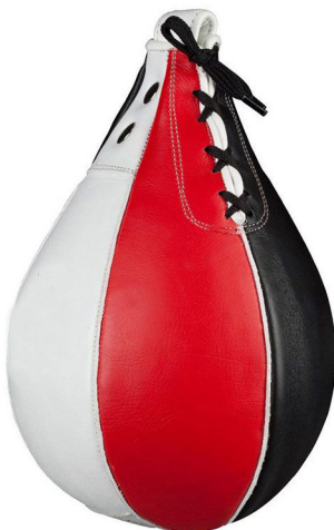
ART # JI-2543