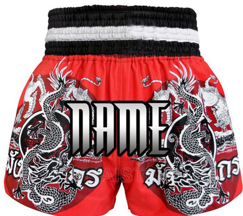
ART # JI-2625