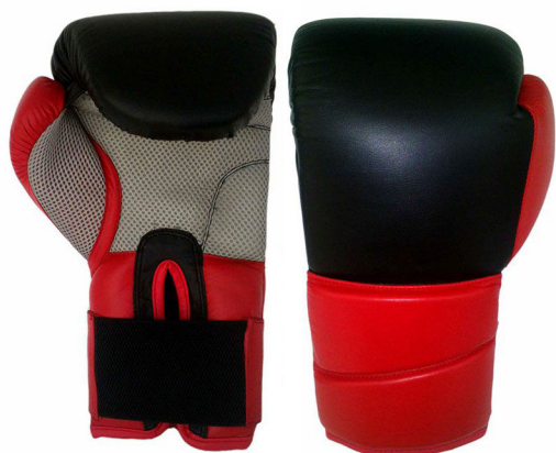
ART # JI-2523