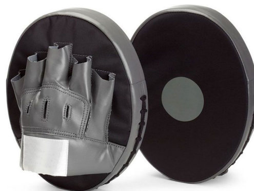
ART # JI-2864