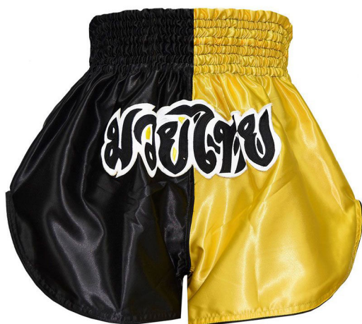
ART # JI-2627