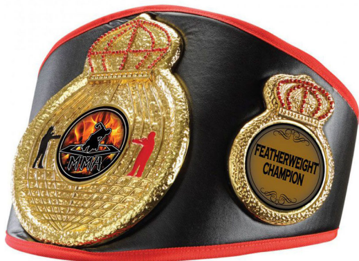
ART # JI-2681