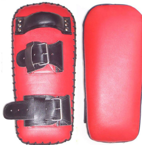
ART # JI-2746