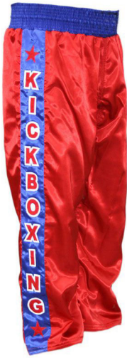
ART # JI-2605