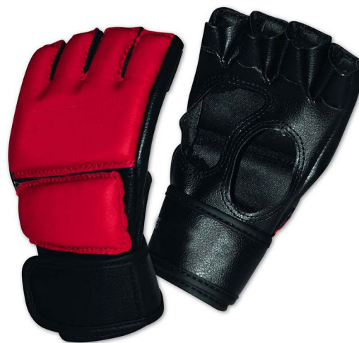
ART # JI-2502