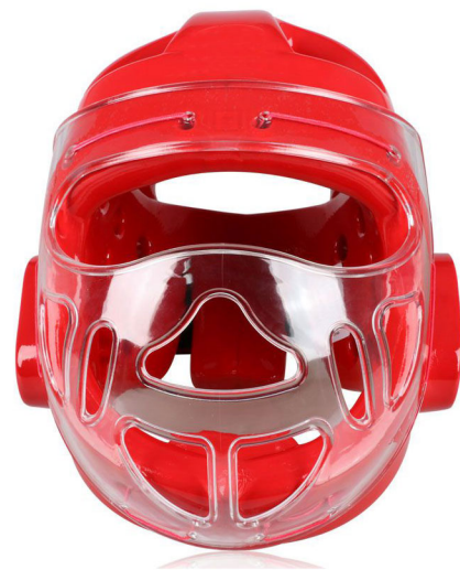
ART # JI-2808