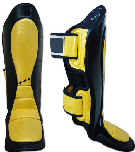
ART # JI-2567