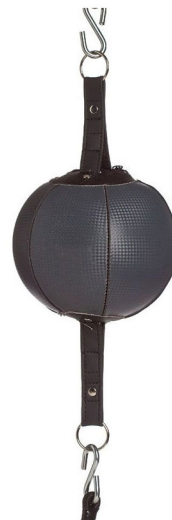
ART # JI-2886