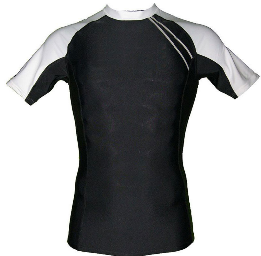
ART # JI-2724