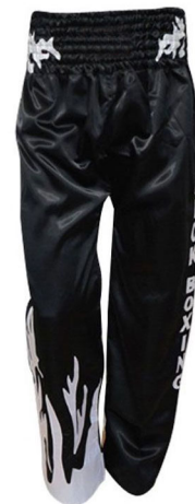
ART # JI-2608