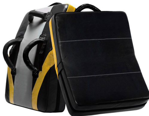
ART # JI-2642