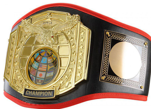
ART # JI-2688