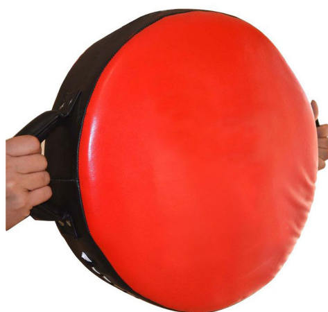
ART # JI-2648